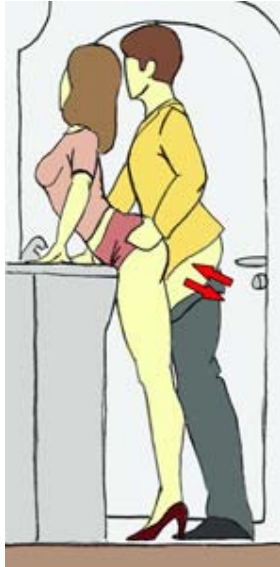
Intercourse - Doggy-Style Against Sink Save time by using this position to wash your hands or fix your makeup while having sex.